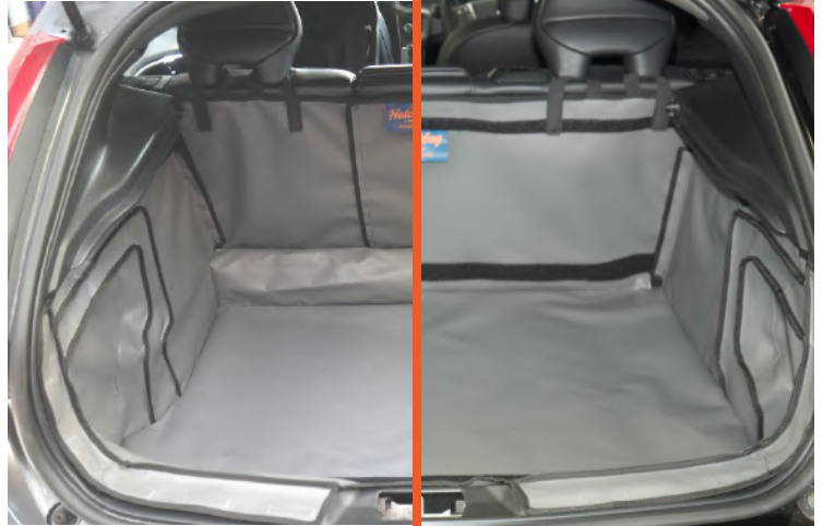
FNO (No false floor) Rear split.