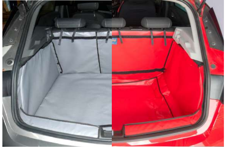
RAISED VERSION Rear Split version prepared for a Seat Flap