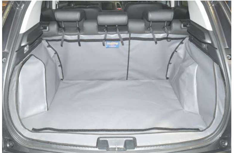
Split bootliner with fixing for the Bumper Flap and Seat Flap