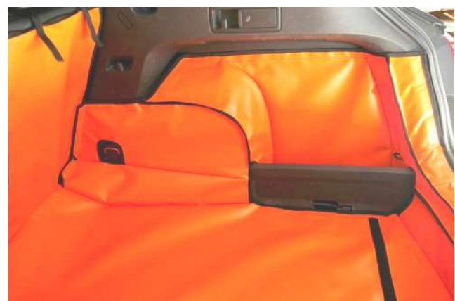
Lowered Boot Offside