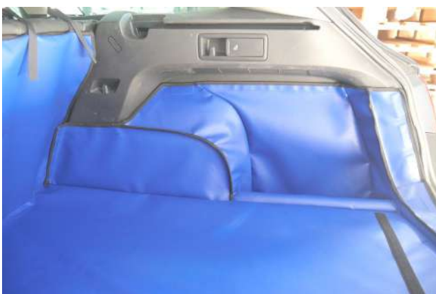
Raised Boot Offside