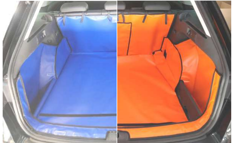
LEFT - Raised Floor - Split Bootliner RIGHT - Lowered Floor - Ski Flap Bootliner