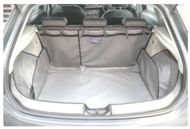
Split bootliner with preparation for seat flap