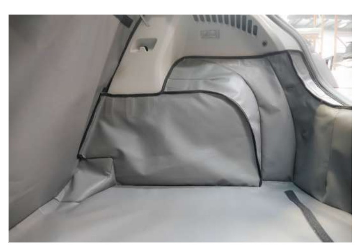
Boot liner - Offside