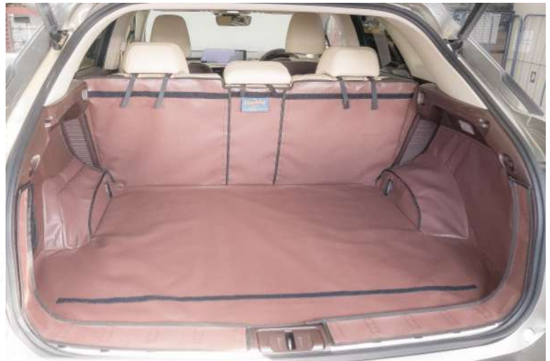
Rear split liner with seat flap and bumper flap prep.