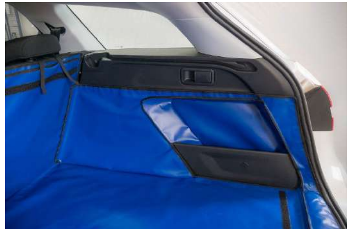
OFFSIDE BOOT LINER