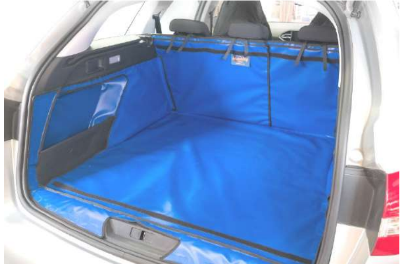
Split boot liner with Seat Flap and Bumper Flap Prep