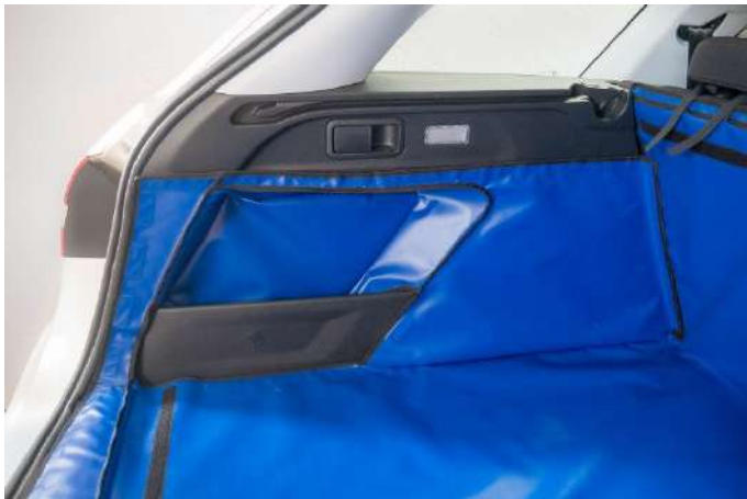
NEARSIDE BOOT LINER