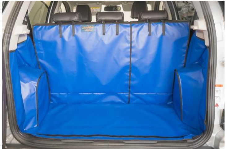
Split Bootliner prepared for an additional bumper flap