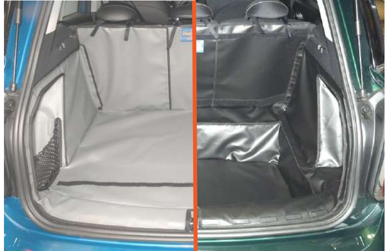
FRSD NET Split boot liner with bumper flap prep