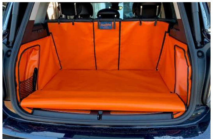
BUMPER FLAP - OPTIONAL EXTRAS