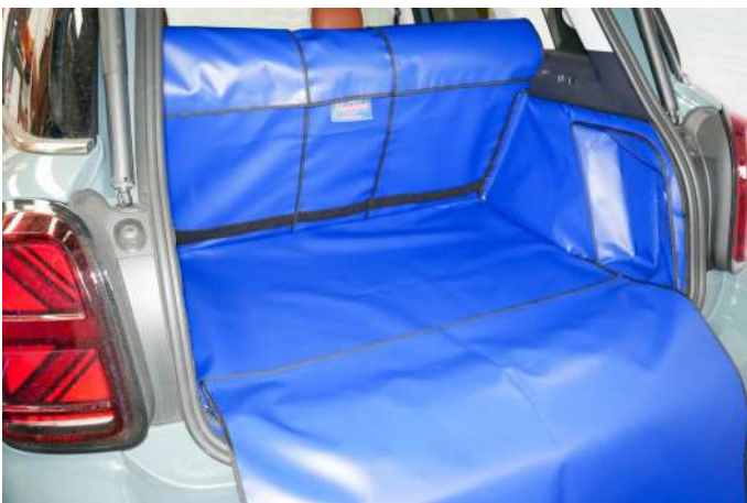
BUMPER FLAP & SEAT FLAP - OPTIONAL EXTRAS