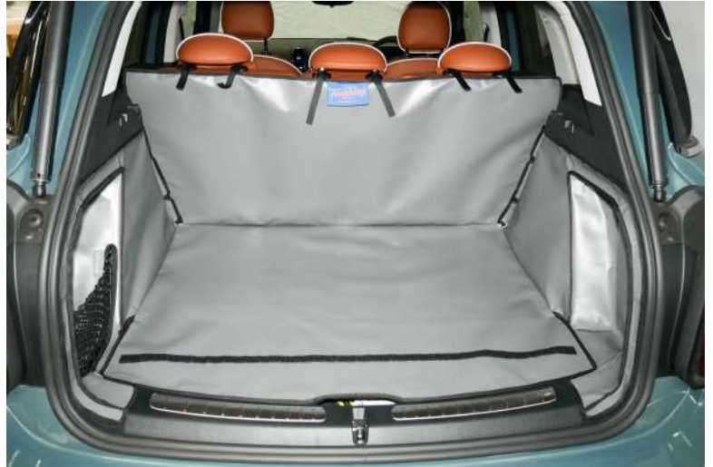
Rear plus boot liner with bumper flap prep