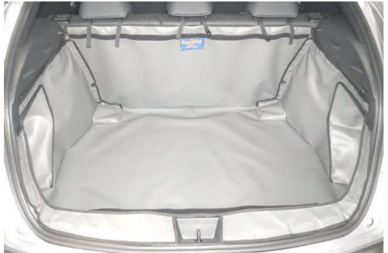
Low floor version - Plus boot liner with seat flap and bumper flap prep