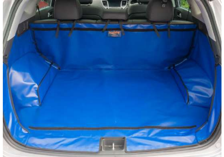
Photo shows a Rear Plus option prepared for Seat Flap and Bumper Flap