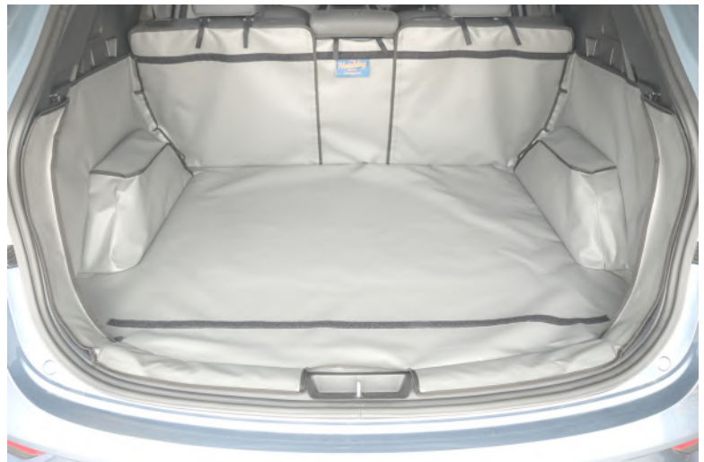
7 seater - Split boot liner with bumper flap and seat flap