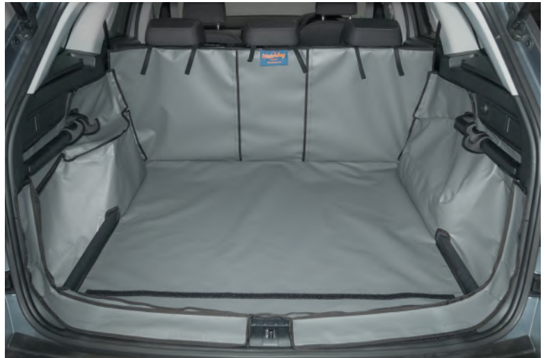
Split boot liner with bumper flap prep