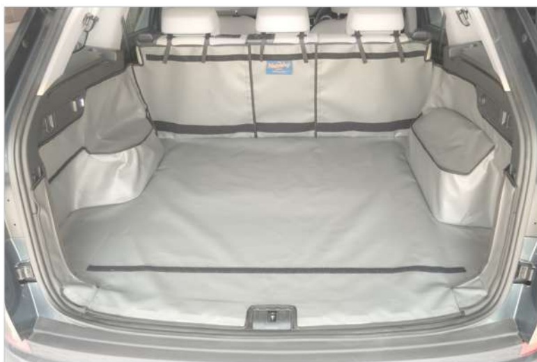
Split boot liner with bumper flap, seat flap and boot liner extension prep