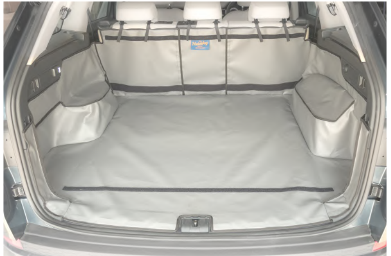
Split boot liner with bumper flap, seat flap and boot liner extension prep