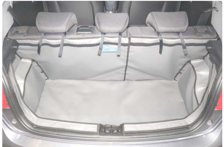
Split bootliner with seatflap prep