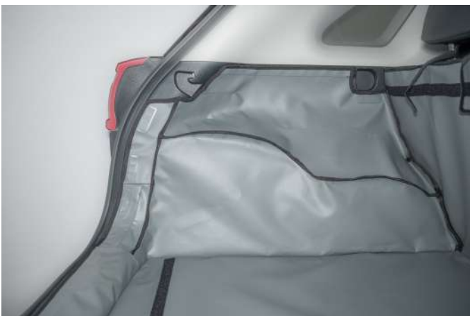
NEARSIDE - WITH SPEAKER