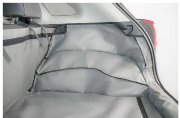
OFFSIDE - SHAPE 2 - WITH AUXILIARY BATTERY