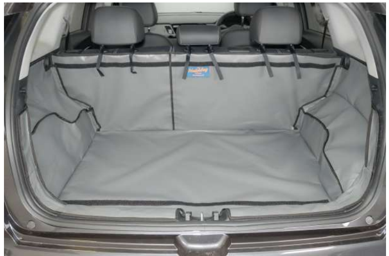
Shape 2 + No Nearside Speaker Version Split boot liner with SF and BF prep