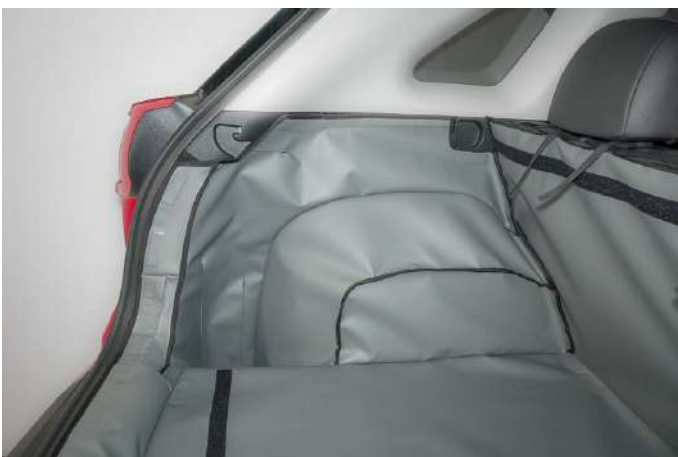
NEARSIDE - NO SPEAKER