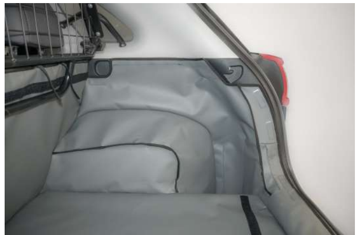
OFFSIDE - SHAPE 1 - NO AUXILIARY BATTERY