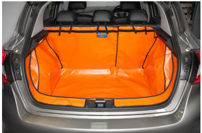
Boot liner with rear split and seat flap prep.