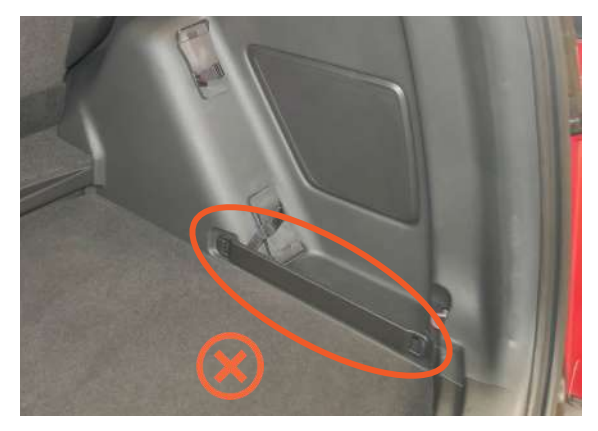
The boot liner does not accommodate these separators, they need to be removed from the vehicle before fitting.