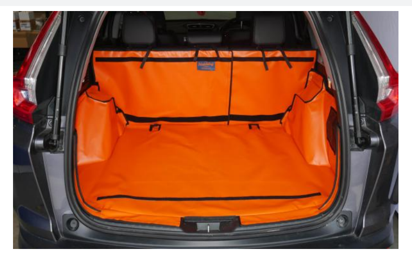
Rear split, prepared for seat flap, bumper flap & boot liner extension. Front D-ring access and speaker mesh optional extras