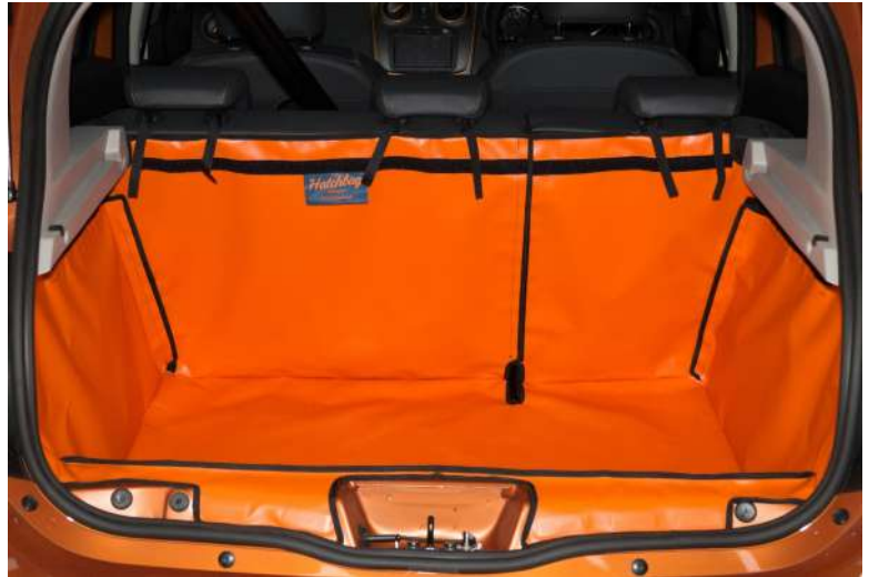
Seat split, prepared for a seat flap.