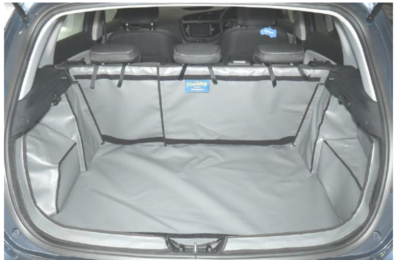
Rear split, prepared for bumper flap, seat flap and boot liner extension