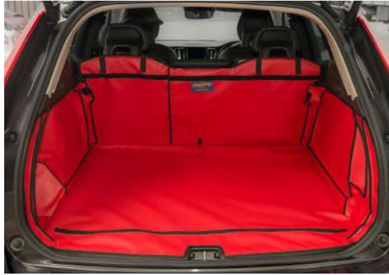
NETNO Rear seat split version prepared for a bumper flap & seat flap