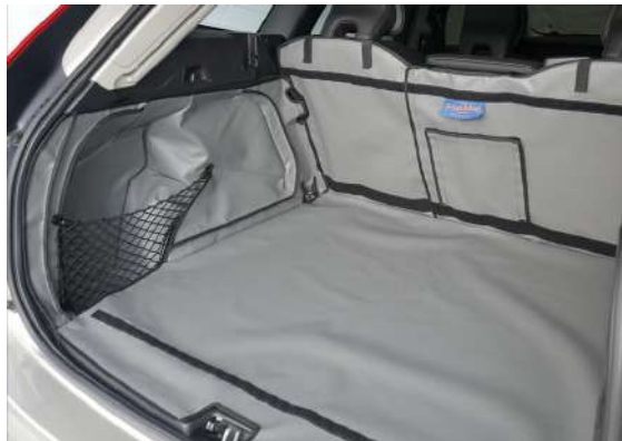
NET Rear seat split & Ski flap version prepared for a bumper flap & seat flap & Bootliner Extension