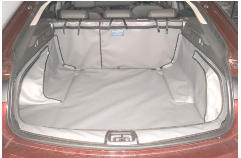
Boot Liner with rear split, and seat flap prep