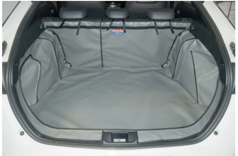
Boot liner with rear split and seat flap prep