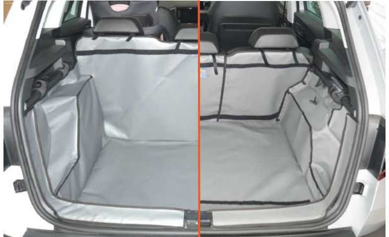
FLOW Boot version, prepared for bumper flap and seat flap