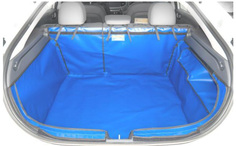
Shape 1 - Split boot liner with seat flap prep