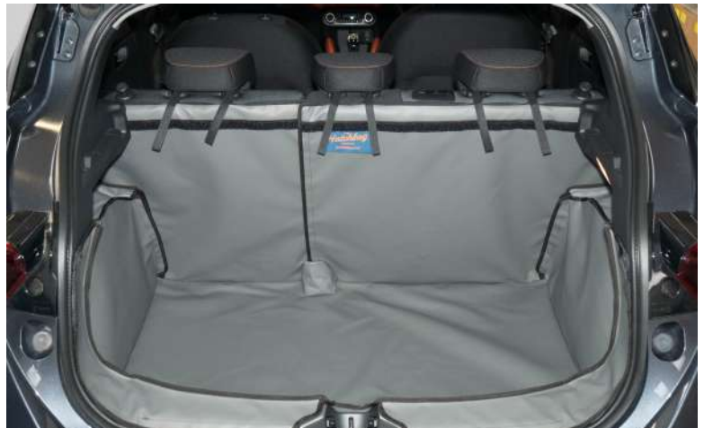
Rear split, prepared for seat flap