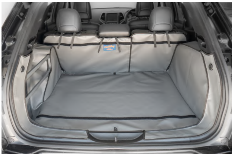
Split boot liner prepared for an additional seat-flap and bumper-flap