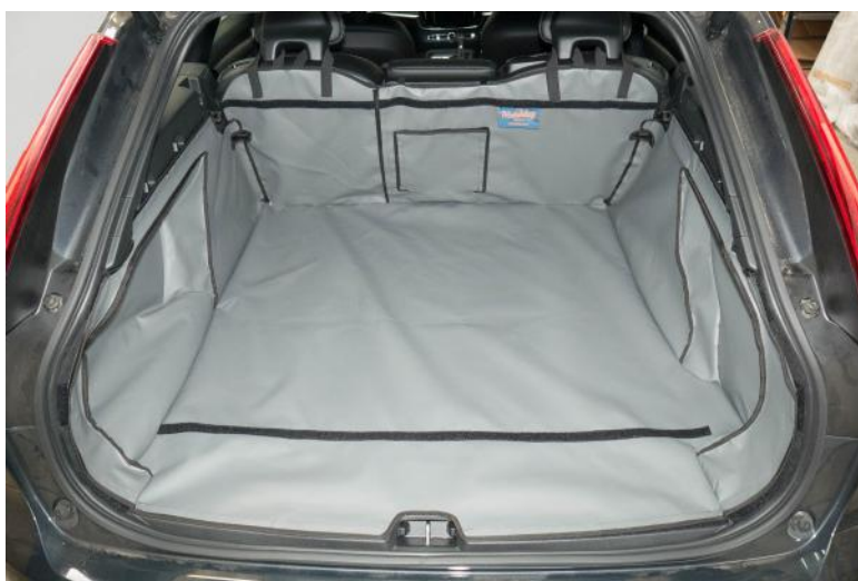
Rear split, prepared for bumper flap and seat flap.