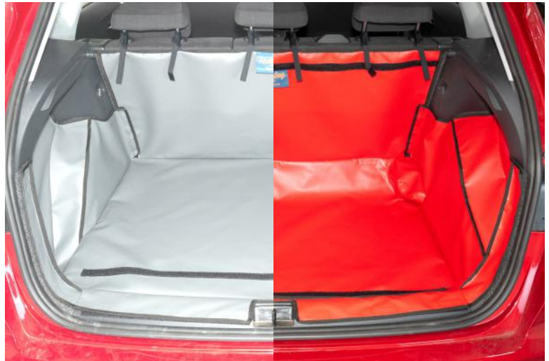
Left; Raised floor version, Right; Low floor version (Boot liners include prep for bumper flap and seat flap)