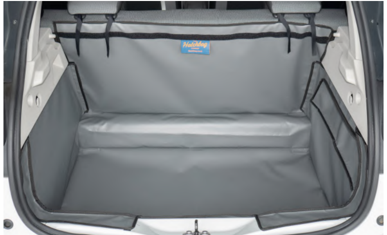
Rear split, prepared for seat flap