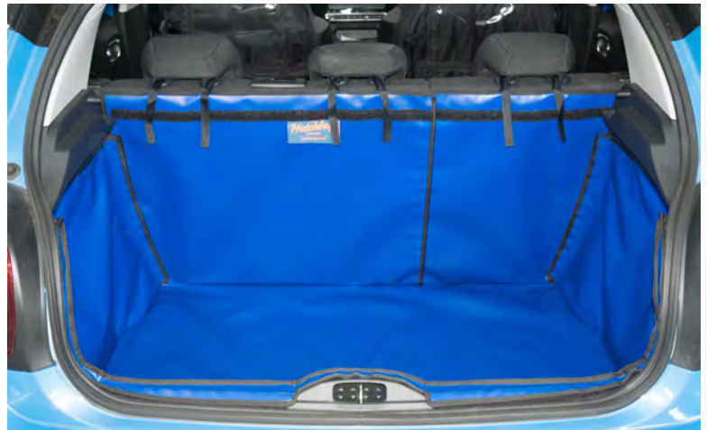
Rear split, prepared for seat flap