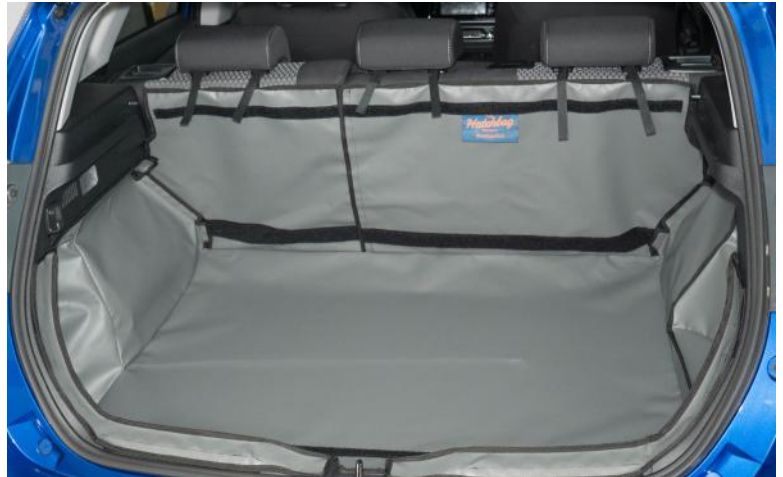
Rear split, prepared for bumper flap, seat flap and floor extension