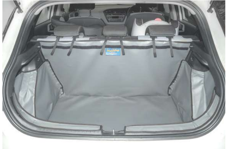
Plus boot liner prepped for a seat flap