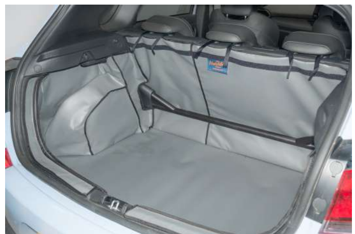
BOOT SHAPE 5 —LEFT SIDE