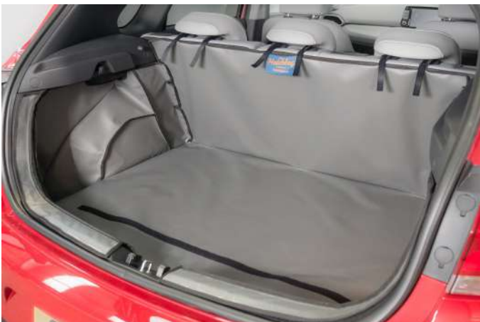
BOOT SHAPE 3 —LEFT SIDE