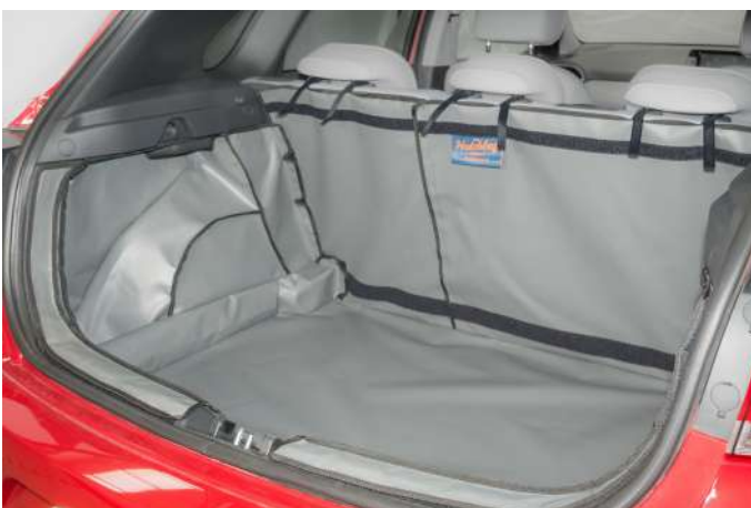
BOOT SHAPE 4 —LEFT SIDE