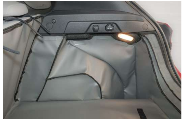
BOOT SHAPE 3 —RIGHT SIDE