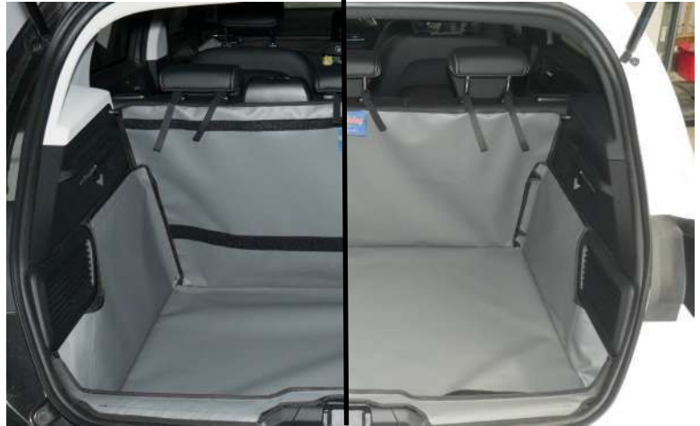
Left: FLOW Rear Plus Bootliner, prepared for seat flap & Bootliner extension