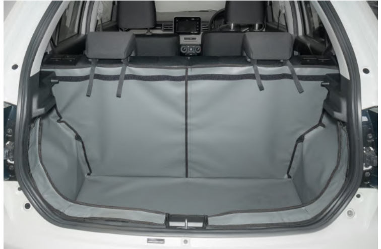
Rear split boot liner prepped for a seat flap