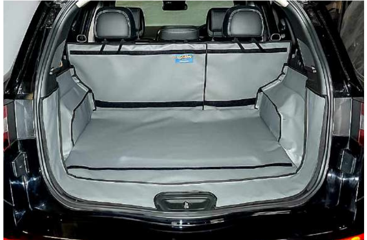
Rear Plus with Seat Split boot liner prepped for a seat flap, bumper flap and Bootliner Extension