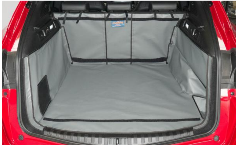
Rear split, prepared for seat flap, bumper flap & floor extension