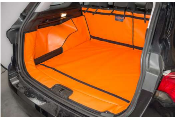
FALSE FLOOR RAISED—NEARSIDE