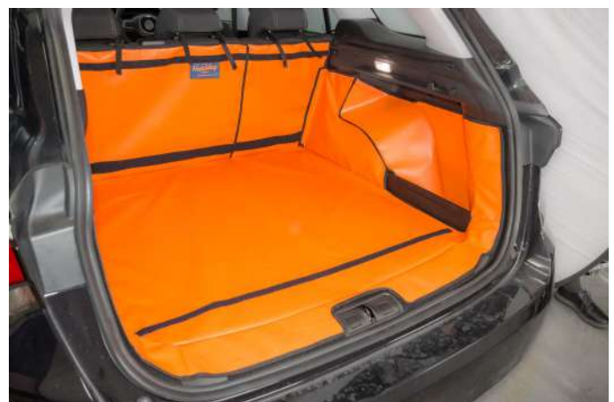
FALSE FLOOR RAISED—OFFSIDE