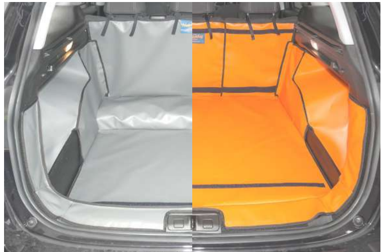
Left - low boot liner (with rear plus) Right - raised boot liner (with rear split and seat-flap, bumper flap and bootliner extension prep)