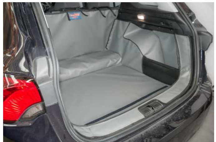
FALSE FLOOR LOWERED—OFFSIDE