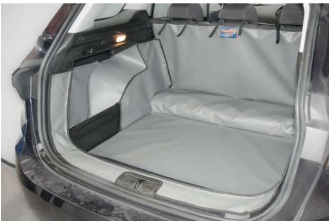
FALSE FLOOR LOWERED—NEARSIDE