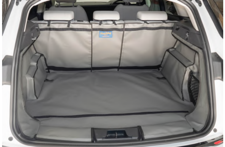
Rear Plus With Seat Split boot liner Inc. D-Ring access with preparation for a seat flap, bumper flap and Bootliner Extension.