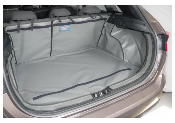
False floor raised - Offside