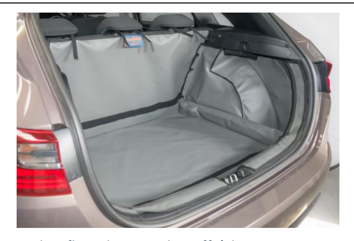
False floor lowered - Offside