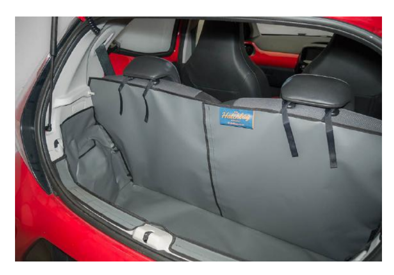
Rear Plus with Seat Split boot liner