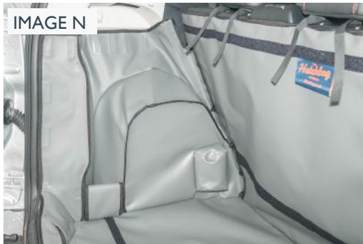
FOUT - NEARSIDE