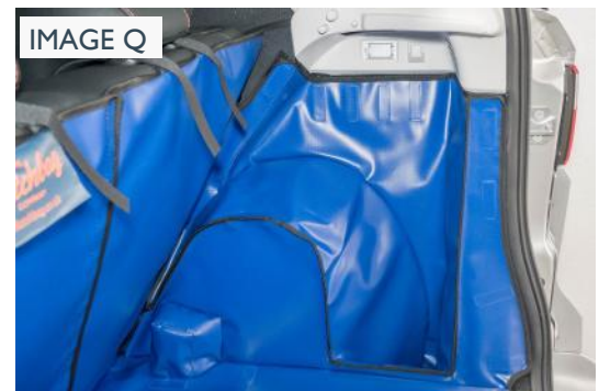
FMID - OFFSIDE