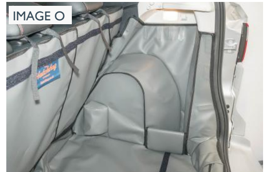
FOUT - OFFSIDE