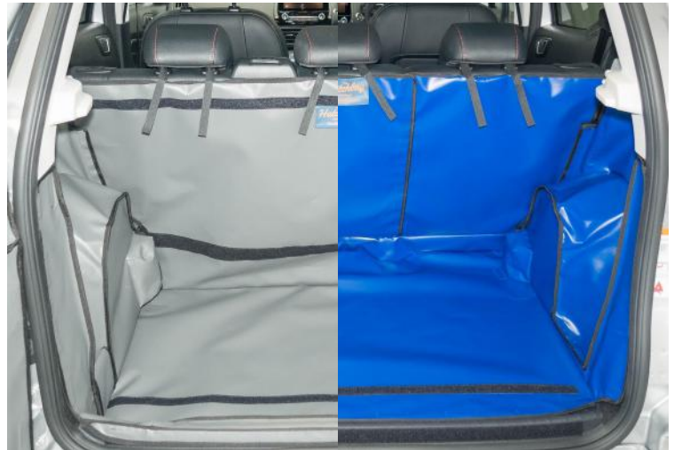
Left photo: FOUT Bootliner – Rear Plus version prepared for seat & bumper flaps and Bootliner extension