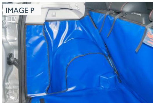
FMID - NEARSIDE