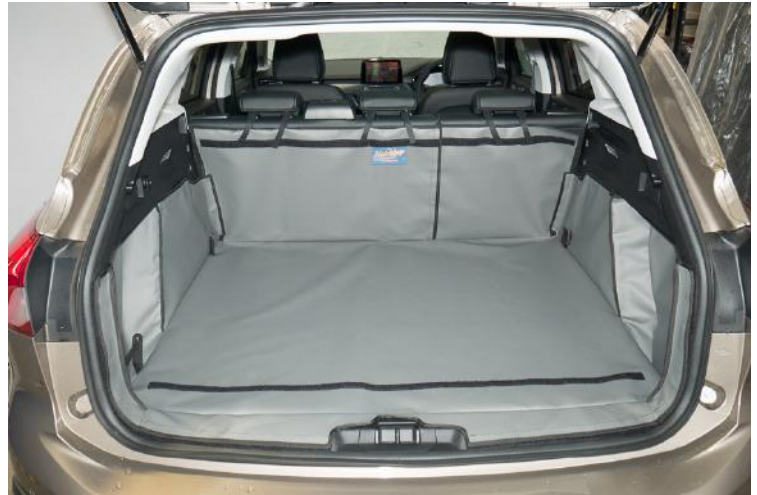
Rear split boot liner prepped for seat flap and bumper flap