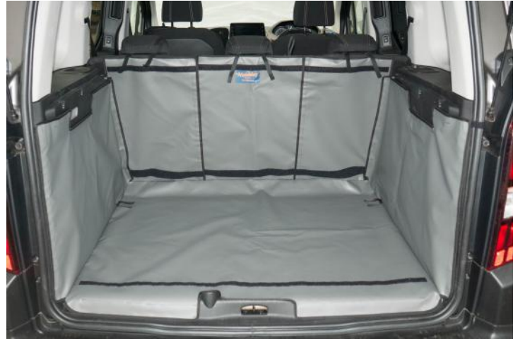
Rear split boot liner prepped for seat flap, floor extension and bumper flap