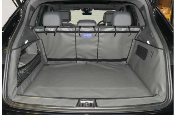
SH1- Rear Plus with Seat Split boot liner prepped for a seat flap, bootliner extension and bumper flap.