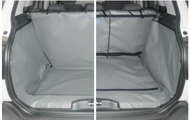
Left: False floor lowered – rear plus Right: false floor raised – split boot liner prepared for accommodate bumper flap, seat flap and bootliner extension