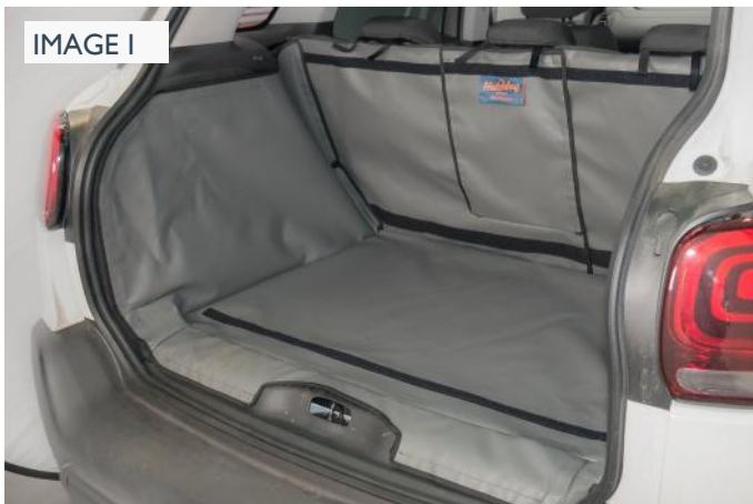
FRSD - FALSE FLOOR RAISED