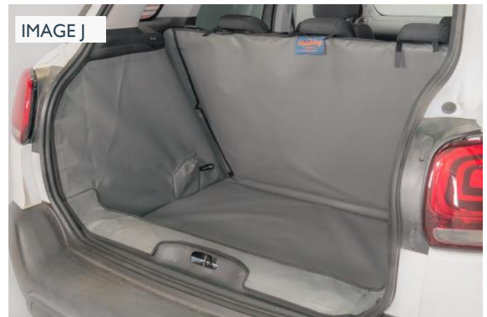
FLOW - FALSE FLOOR LOWERED