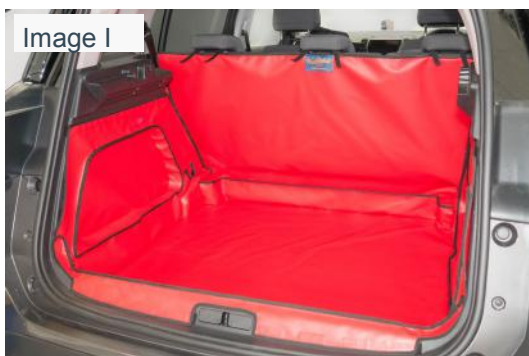
FLOW version boot liner