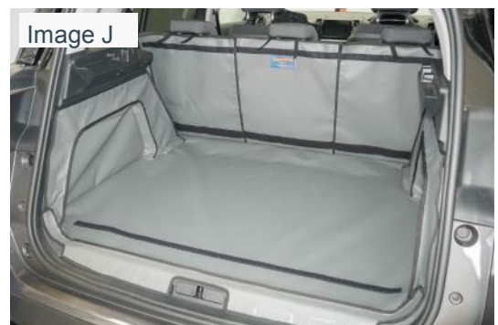
FRSD version boot liner