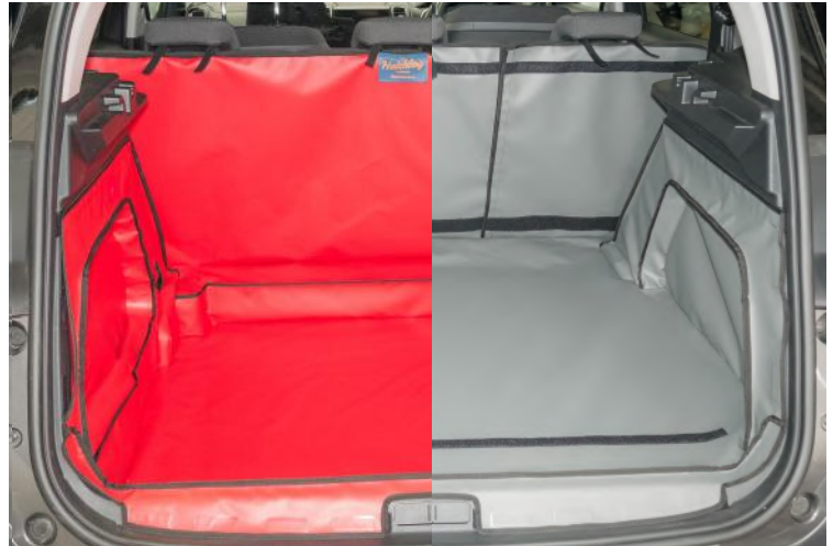
Left: FLOW boot liner